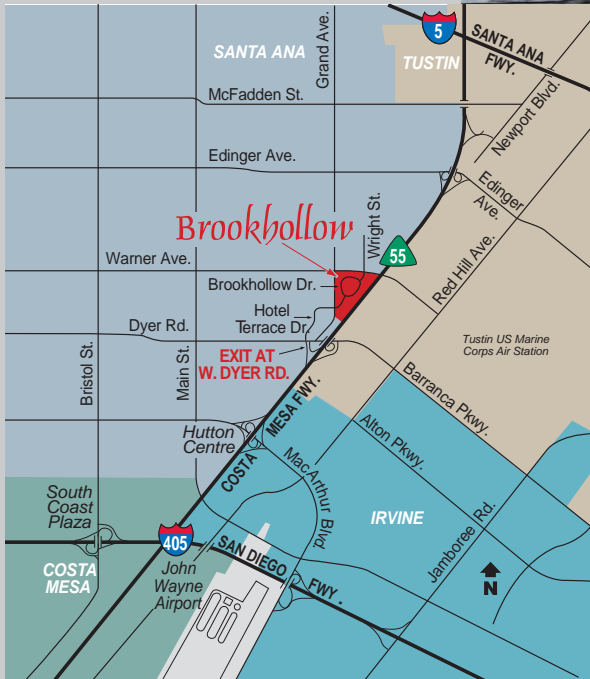
55 FREEWAY FRONTAGE